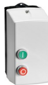
Empty enclosures M2PA